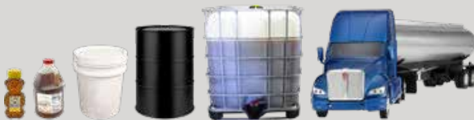
Retail Bottles, Jugs, Pails, Drums, Totes, and Tankers

Our honey is available in the following pack sizes: