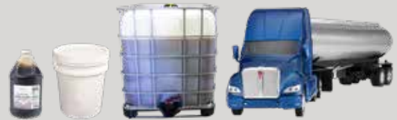
Jugs, Pails, Totes, and Tankers

Our molasses is available in the following pack sizes: