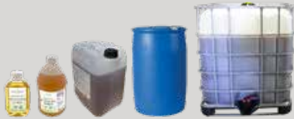
Retail Bottles, Jugs, Cannisters, Poly Drums, and Totes

Our agave is available in the following pack sizes: